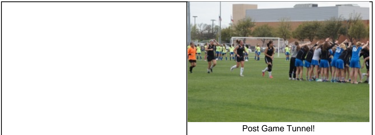
Post Game Tunnel!