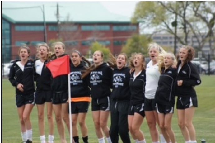
16's cheering on the 12's