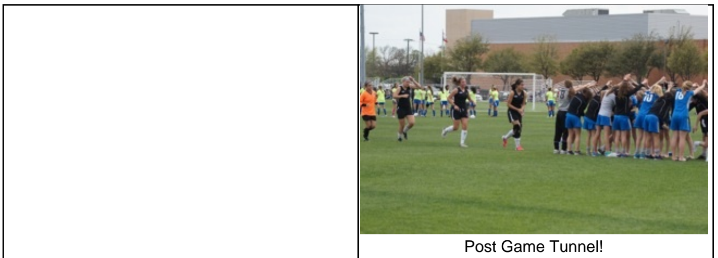
Post Game Tunnel!