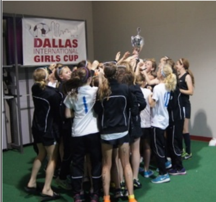
Players Celebrate with Trophy