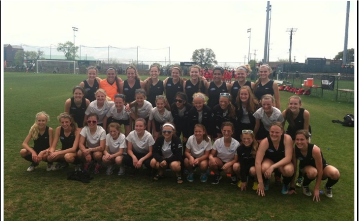
12's and 16's Post Championship

Rush Soccer: How did you feel your team's overall performance was?