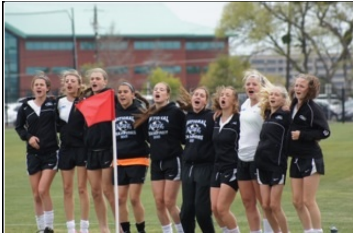
16's cheering on the 12's