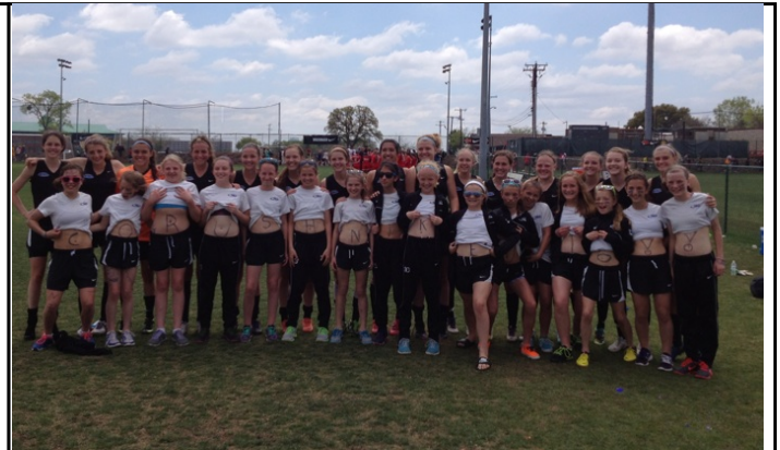
12's (with paint) supporting the 16's

Rush Soccer: Both teams (12s and 16s) spent time hanging out at the hotel, at restaurants and at the fields? What was that like?