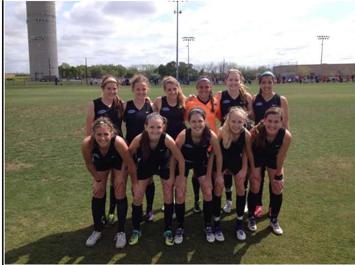
U16's First 11 in Final