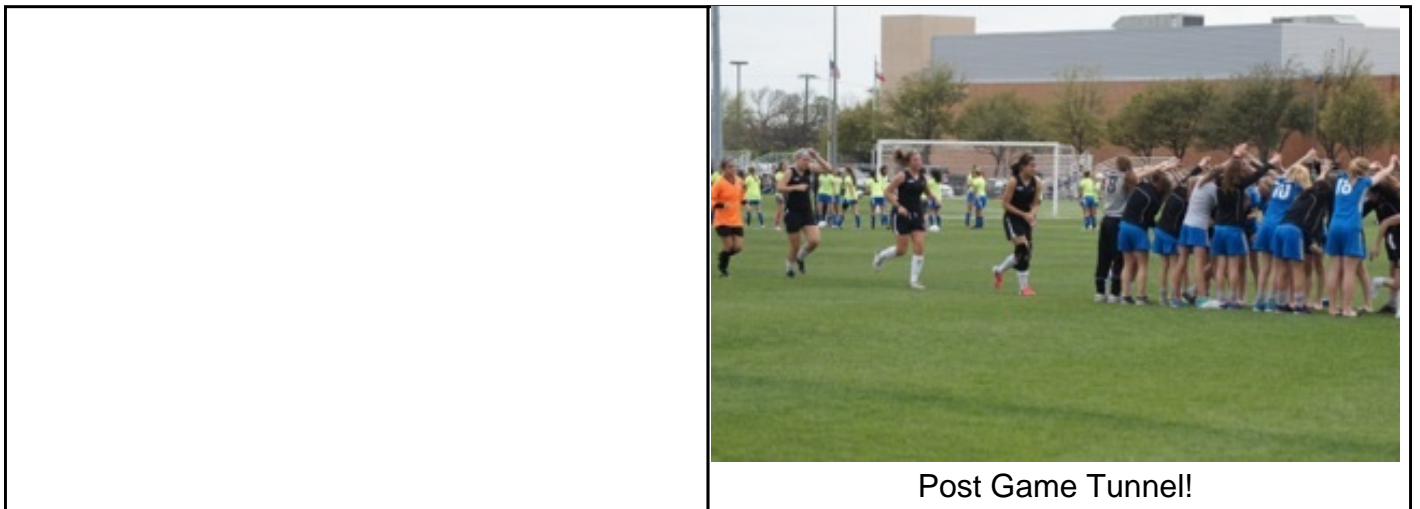
Post Game Tunnel!