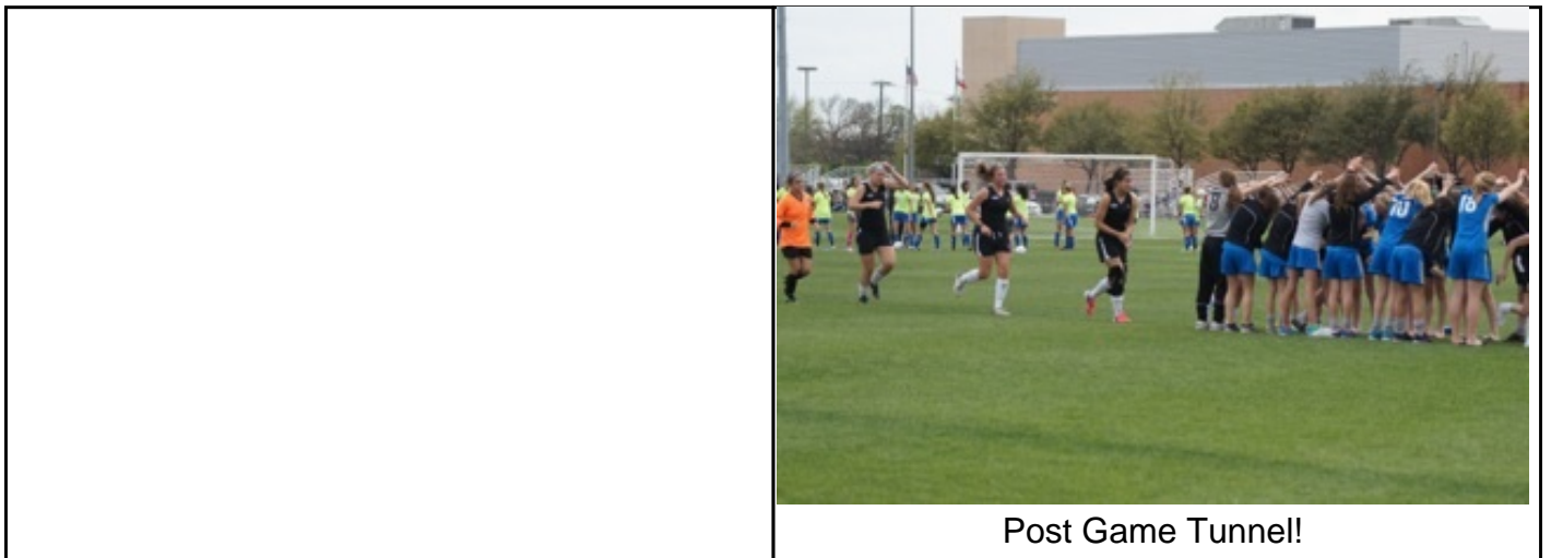
Post Game Tunnel!